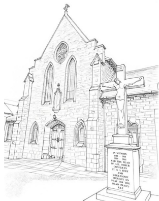
Lobster Road Redcar, TS10 1SH