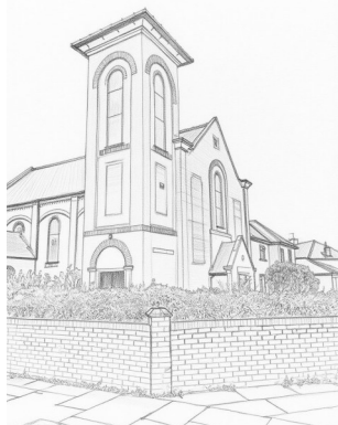
Warwick Road Redcar, TS10 2ER