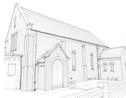
Southfield Road Marske, TS11 7BP